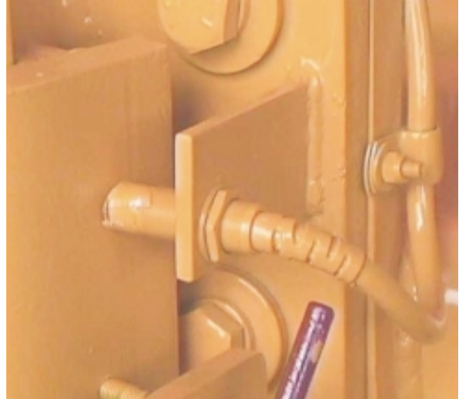
LIFTING FRAME PROXIMITY SWITCH