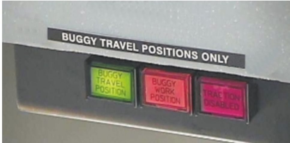
PROJECTOR BUGGY TRAVEL INDICATOR LIGHTS