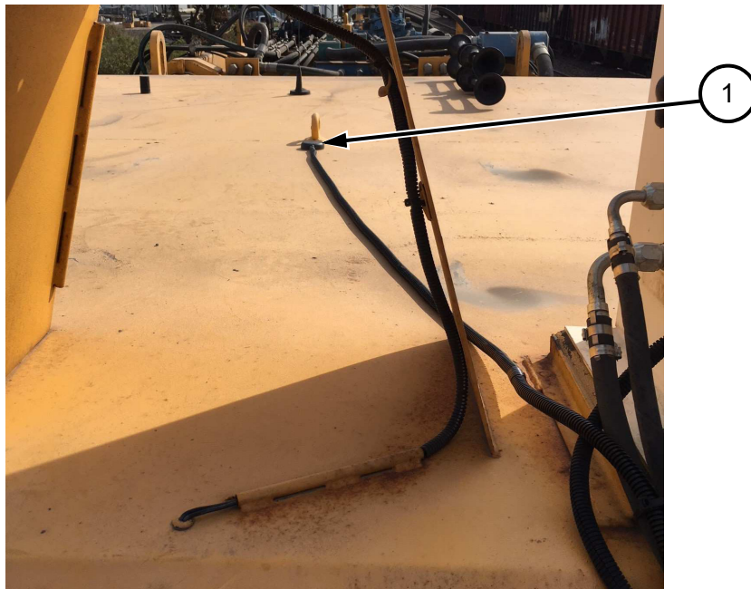
FIGURE 1 OLD GPS ANTENNA (5048280)